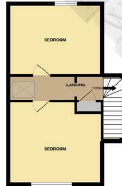
2ND FLOOR 393 sq.ft. (36.3 sq.m.) approx.